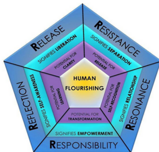
5 Rs Model

At the end of the session , you will be asked questions about your experiences to help you create a deeper connection with your inner self.